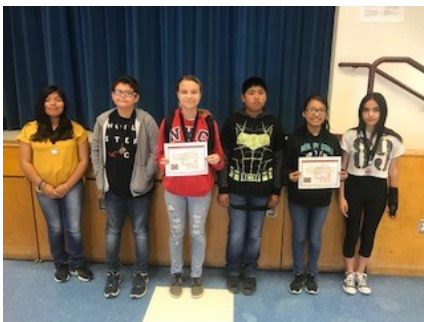
Gold Winners - 1,000,000 Words Read this year!