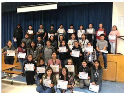
Blue Winners - 250,000 Words Read this year!