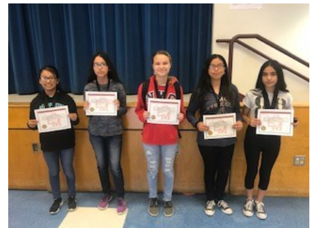
Silver Winners - 750,000 Words Read this year!