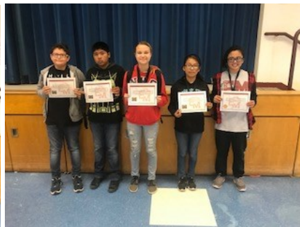
Bronze Winners - 500,000 Words Read this year!