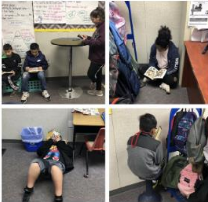
We are creating READERS!

assignments nor do they require intervention, and during this time, they may pick an enrichment activity option.